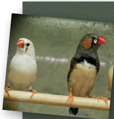
Right - Male Zebra Finch